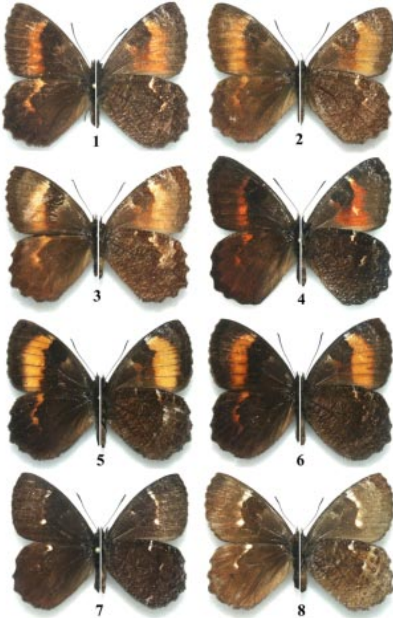
1-8. Adults, left: dorsum, right: venter: 1- Pedaliodes praxia praxia , male form 1 (Gualaceo-Limón), 2 - P. praxia praxia , male form 2 (Gualaceo-Limón), 3 - P. praxia praxia , female (Gualaceo-Limón), 4 - P. praxia buckleyi , male (holotype), 5 - P. puciula , male (holotype), 6 - P. puciula , male (paratype), 7 - P. puracana , male (Papallacta), 8 - P. puracana , female (Papallacta)